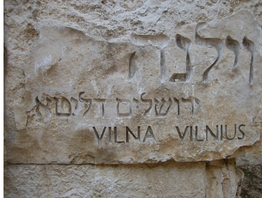
from Valley of the Communities, Yad Vashem