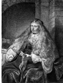
Esther with the Decree of Destruction, etching - 1635, Rembrandt Harmensz. van Rijn, Rijksmuseum, Amsterdam

Facebook: MCJC - Mendocino Coast Jewish Community MCJC Kids