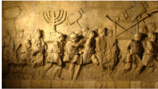
The sack of Jerusalem (70 CE), Arch of Titus

http://www.mcjc.org/mjoldart/Megillah/MJMM0000.htm Facebook: MCJC - Mendocino Coast Jewish Community