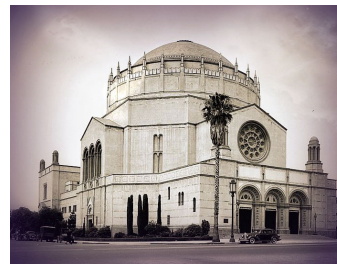
Wilshire Boulevard Temple, LA, CA (circa 1929)

All are invited to Shabbat dinner at the shul, Friday, November 7, 6:00 PM. We'll light candles, sing a bit, have a nice veggie dinner and enjoy each other's company and the spirit of Shabbat peace. You don't need to RSVP or bring anything -- just come. We love having children come to the tisch (and adults too!) This isn't our usual last Friday of the month date, as you can see. Future tisch dates TBA. (mh)